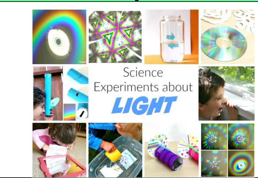
Science Experiments about LIGHT