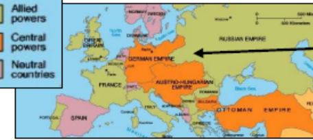
WW1 Countries (Europe)